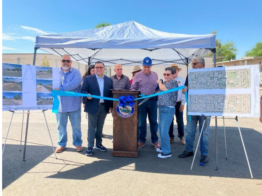
Figure 3, Ribbon Cutting Ceremony for Heber Townsite Improvement Phase I Project, August 09, 2024.

As part of the emission reduction project, the Air District recently completed a paving project for the Heber Townsite Improvements Phase I for various roads (Heber, CA) in May 2024. The project consisted of providing multiple sidewalks and paving to various existing dirt roadway segments within Heber, CA, which results in an annual PM 10 emission reduction of 1,505.02 tons/year. For details, please refer to Appendix A.