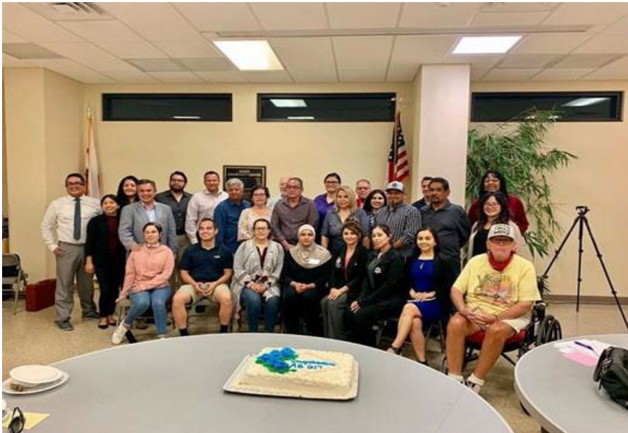
Figure 1 Approval of the CERP by the CSC, October 2, 2019 (Heber, CA)

The CSC adopted the CERP for the El Centro-Heber-Calexico Corridor on October 2, 2019, and subsequently the Air District Board (Imperial County Board of Supervisors) approved the Plan on October 8, 2019. On November 13, 2019, CARB Staff held a public workshop at Imperial Valley College (Imperial, CA) to present and discuss the objectives and strategies of the CERP. The public took this opportunity to share their opinions on the CERP, and the overall AB 617 Program/CAPP, which CARB recorded as the agency reviewed the CERP prior to CARB Board's consideration of the Plan. On January 15, 2020, at a special public meeting held in El Centro, CA, the CARB Governing Board considered and voted to adopt the CERP for the Corridor.