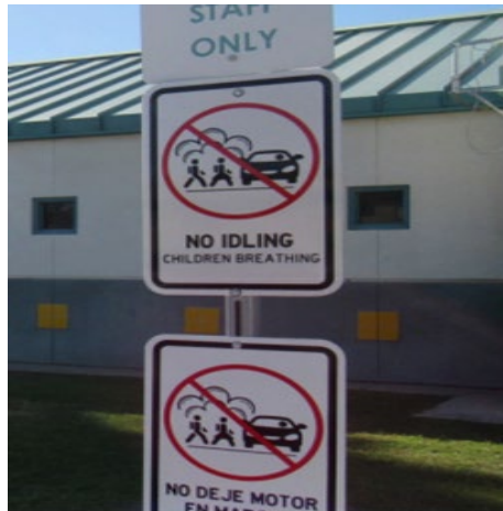
No Idling sign installed in Desert Oasis Highschool in El Centro, CA.