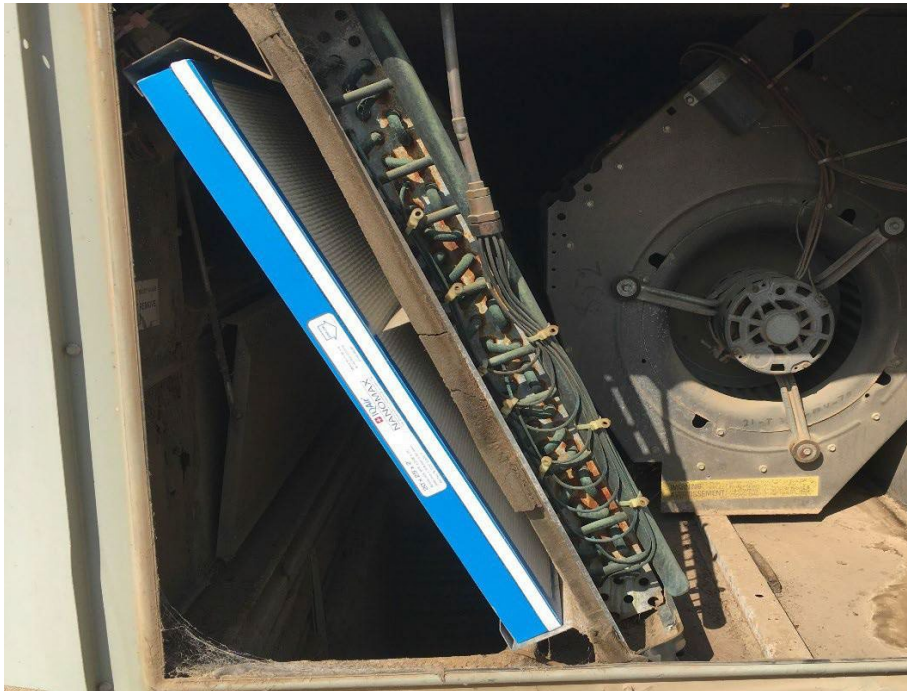
Figure 4 HVAC unit with IQAir High Performance Filter (Heber School, Heber, CA)

The final mitigation strategy included in the CERP is the installation of air filtration systems (systems) at sensitive receptor locations such as schools in the Corridor. It has been demonstrated that these systems significantly reduce concentrations of particulate matter (diesel and fugitive dust) and other pollutants in the indoor environment. The Air District has moved forward with implementation of installing air filtrations systems at schools in the Corridor, based on the input received from the CSC in 2019, with the air filtration company IQAir North America, Inc. (IQAir). IQAir has installed air filtration systems throughout the corridor, starting with Dogwood Elementary School (Heber, CA) (leveraged funds used) and Heber School (Heber, CA) (leveraged funds used). There is a total of 2 schools in Heber, 12 schools in Calexico, and 16 schools in El Centro. IQAir has installed a total of 30 systems in Heber, Calexico, and El Centro schools within the Corridor as of September 2024. These systems will benefit receptors (students & staff) at all those locations. The Air District will continue working with IQAir to schedule site assessments and air filtration installations at schools, utilizing AB 617 funding and other funding mechanisms to leverage existing allocated funds for this strategy. For additional details, please refer to Appendix A.