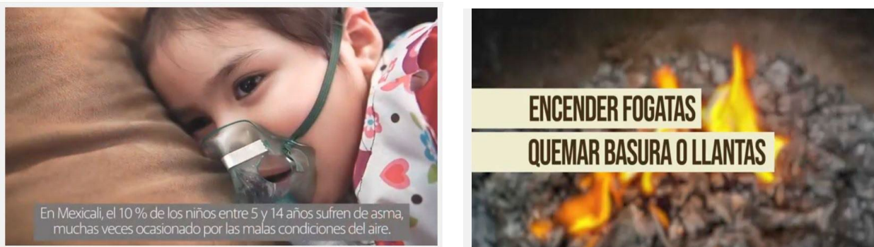
Figure 5: Screenshots of television ad as part of "Ambientalizate,"

Mexico is known for its varied customs and traditions, including commonplace activities such as the use of fireworks and the burning of tires and wood during festivities. To educate the public on the health hazards associated with the burning of these materials, the winter media campaign "Ambientalizate," was established by ICAPCD in 2011 with funding from U.S. EPA. The main objective of this campaign is to educate the public, especially sensitive receptors such as the elderly and children, of the hazardous health and environmental impacts these activities cause in the Mexicali region and Calexico, CA. The campaign airs four separate public service advertisements in Calexico and Mexicali covering specific topics on air quality. The campaign is also broadcasted on nine high frequency radio stations and six television stations approximately 1,500 times from November through January each year. The public service advertisements illustrate the impact these activities have on local health and the environment, with the goal of developing a "no burn" mentality and ultimately breaking these traditions.